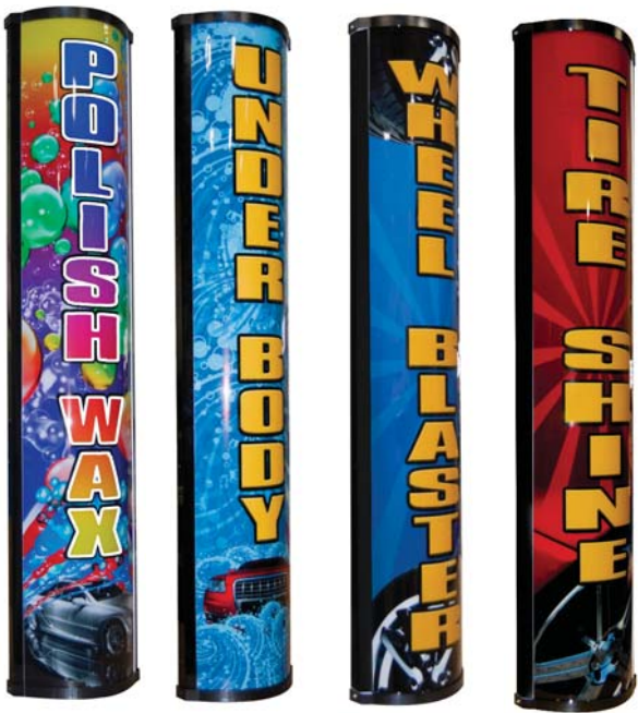
DESIGN A DESIGN B DESIGN C DESIGN D