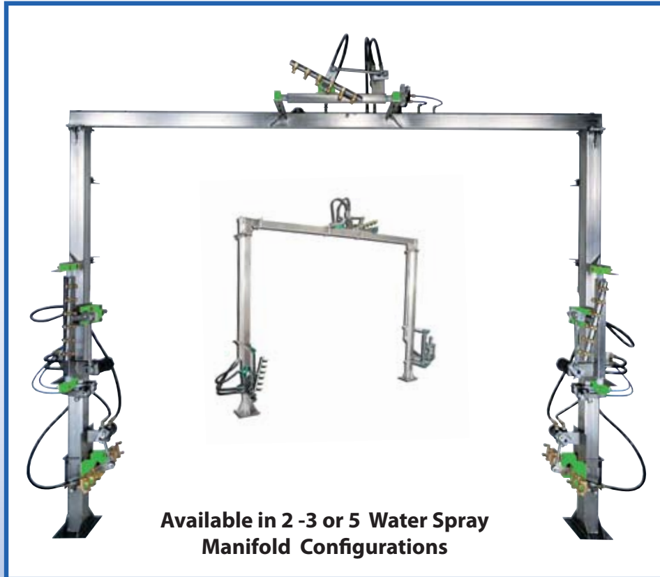
Available in 2 -3 or 5 Water Spray Manifold Configurations