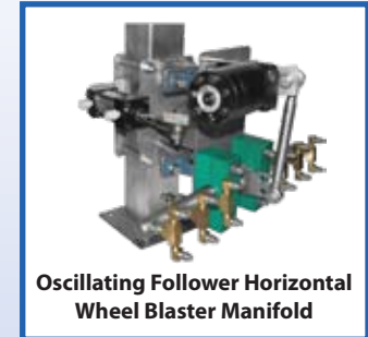
Oscillating Follower Horizontal Wheel Blaster Manifold