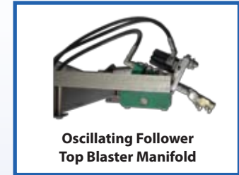
Oscillating Follower Top Blaster Manifold