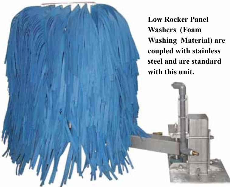
Low Rocker Panel Washers (Foam Washing Material) are coupled with stainless steel and are standard with this unit.

This unique Mini-Tunnel will fit in the same space as most In-Bay Automatics yet processes four times more vehicles per hour! Plus, its simple mechanical design is easy to maintain. No computer engineer needed here! All this and the FASTRAC™ is still priced comparable to much slower and more complex in-bay automatics.