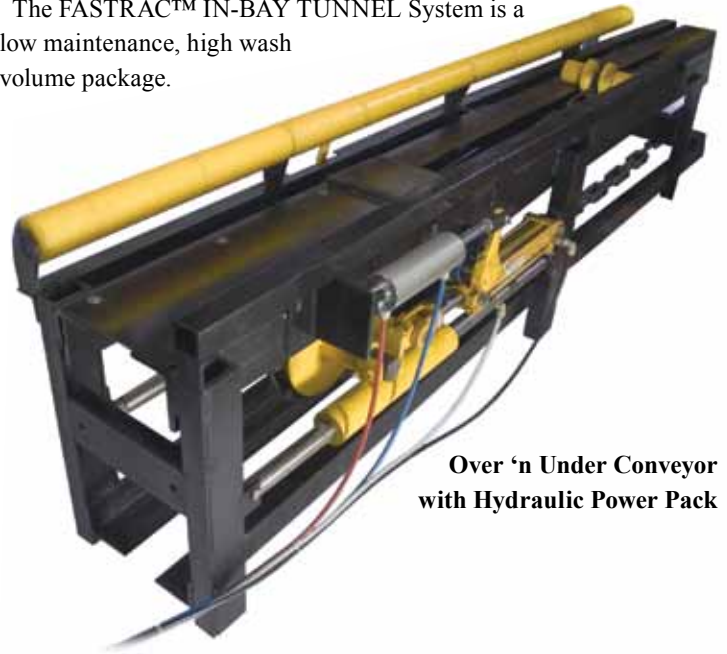
Over 'n Under Conveyor with Hydraulic Power Pack

The FASTRAC™ IN-BAY TUNNEL System is a low maintenance, high wash volume package.